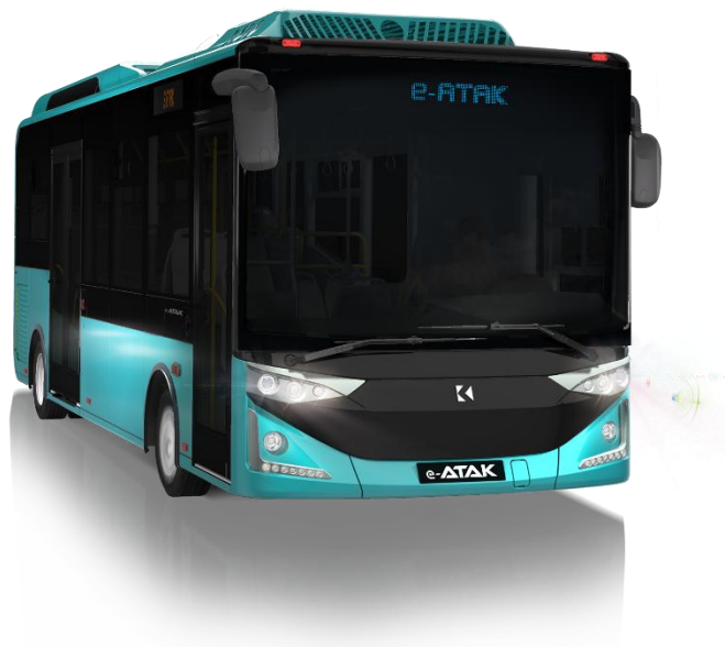
Figure 2. e-ATA 10 meter Electric Bus