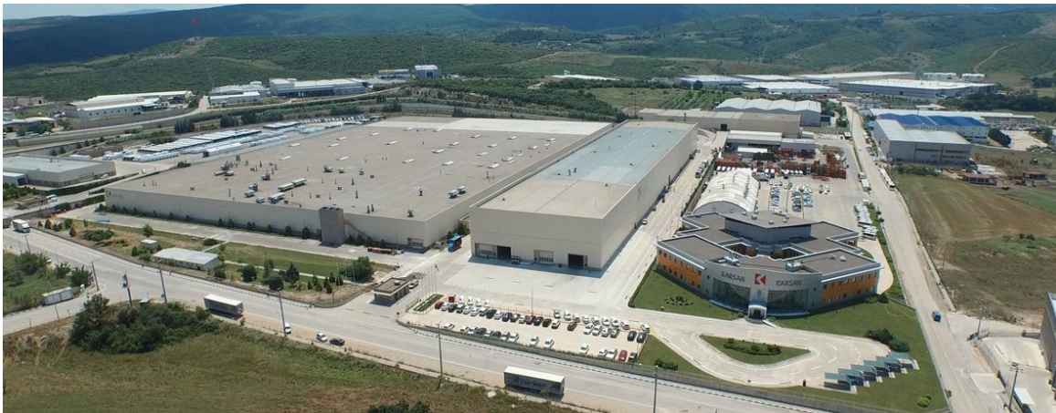
Figure 1. Karsan Production Facility

Name and location of production site/Address of EPD Owner: Organize Sanayi Bölgesi Mavi Cad. No:13 16159 Nilüfer/Bursa